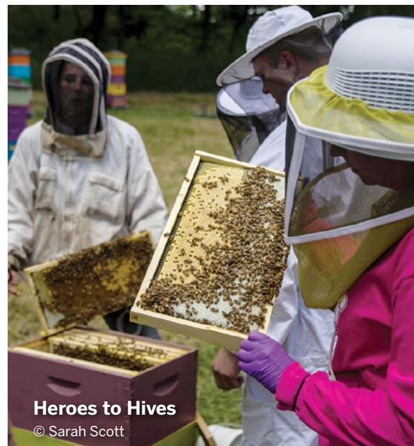
Heroes to Hives