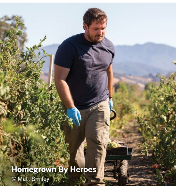
Homegrown By Heroes