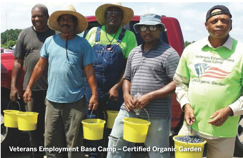
Veterans Employment Base Camp – Certified Organic Garden