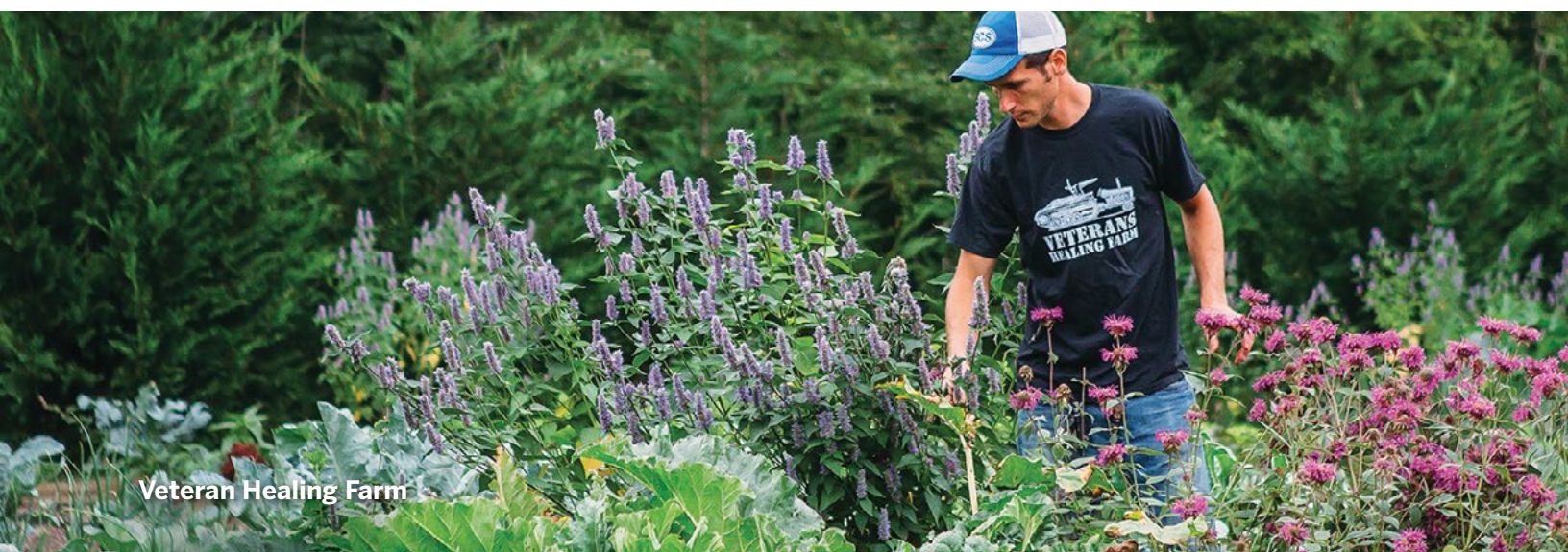
Veteran Healing Farm