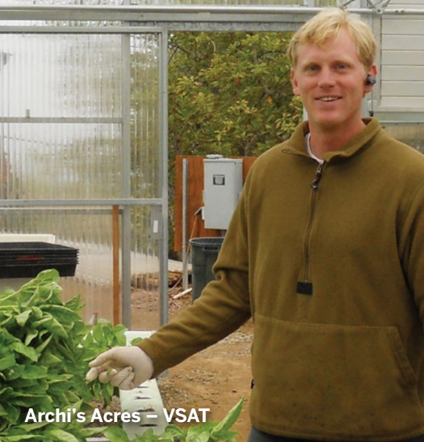
Archi's Acres – VSAT